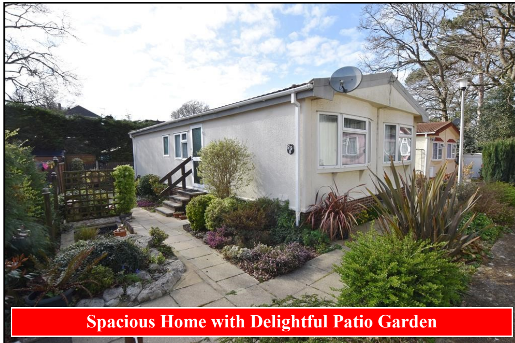
Spacious Home with Delightful Patio Garden

29b Doveshill Park, Barnes Road, Ensbury Park, Bournemouth. BH10 5AJ